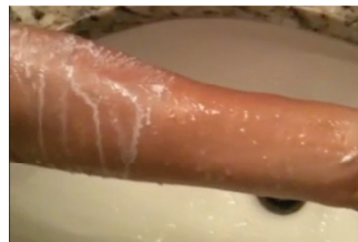
Left side of arm: with traditional free radical film former showing 'white-out' Right side of arm: with CosmoSurf® polymer showing uniform film formation and no 'white-out'